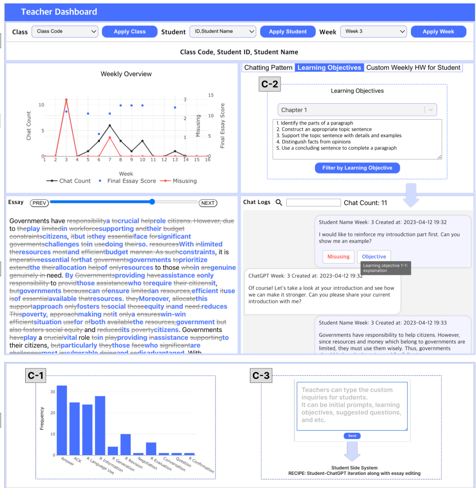
Figure 3: Screenshot of dashboard prototype.