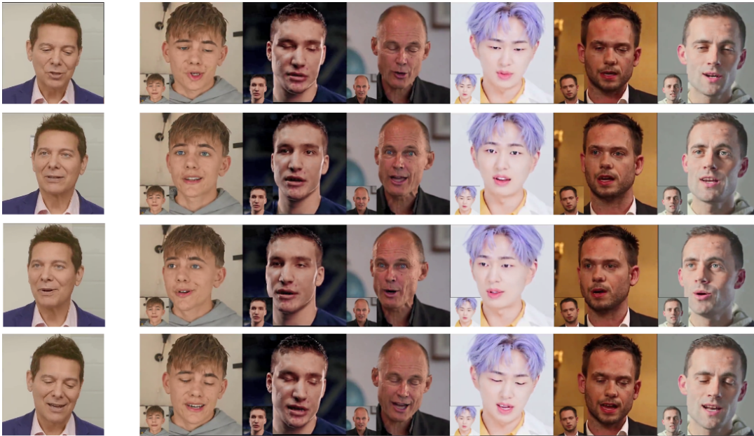
Figure 1. Given a raw driving video (left column), MegActor can synthesize captivating and expressive animations (right column), encompassing the head pose variations and detailed facial expressions present in the input driving video with multiple reference portraits.