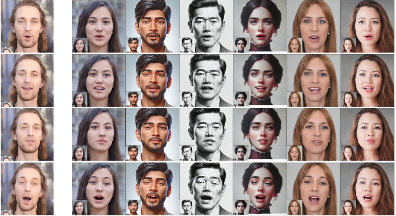
Figure 3. Visualization results. To further demonstrate the generalizability of our approach, we used the official generated results from VASA [54] as the driving video (left column) to animate multiple reference images (right column) from VASA [54]. The enriched and realistic generated videos, encompassing consistent expressions and head movements, showcase the robustness of our approach.

ing UNet. The parameters of the Temporal Layer are initialized from AnimateDiff, and only the Temporal Layer is trained. During both the first and second stage training, we use a mix of AI face-swapping data, stylized data, and real data as driving videos, with respective proportions of 40%, 10%, and 50%. The data sampling stride is set to 2, and the length of the training videos is set to 16 frames. After the first stage training, we fine-tune the model using videos filtered to have significant gaze changes. The data sampling stride is set to 12, and the length of the training videos remains at 16 frames. We conduct training on 8 V100 GPUs. All video frames are resized to 512x512. Throughout the entire training process, we use the AdamW optimizer with a constant learning rate of 1e-5.