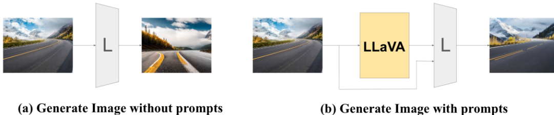
Fig. 2: Comparison between image-to-image generation with and without LLaVA generated prompts

Further investigation is necessary to understand the effectiveness and accuracy of LLaVA’s negative prompt generation in various scenarios (detailed in Future Work). Overall, LLaVA shows great potential as a tool for generating text prompts for image-to-image generation tasks.