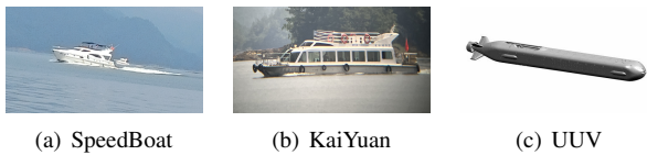
Fig. 2. Target ships

The ship-radiated noise dataset consists of 10,611 records in WAV format with a total of 143 recordings containing single or multiple ship targets. As shown in Fig. 1, our dataset contains 20 categories of targets. Additionally, in order to ensure the integrity of the constructed dataset, we collect some background noise data during nighttime and idle periods. Ultimately, our dataset obtains a total of 9 hours and 28 minutes of real-world ship-radiated noise data and 21 hours and 58 minutes background data, which can be download on https://iee-dataport.org/documents/qiandaoear22 .