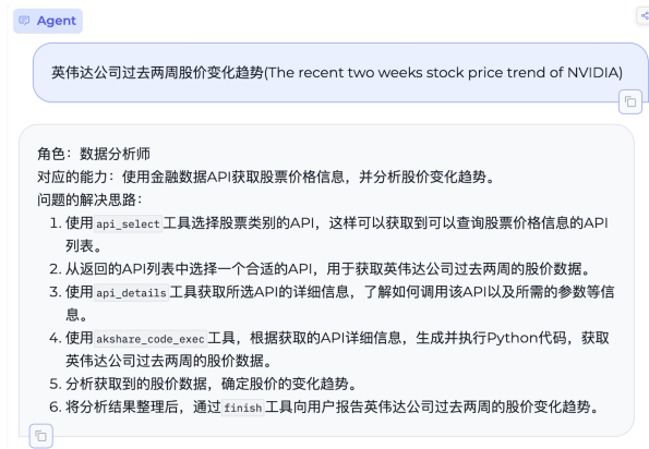
Figure 3: Demo showcase of agent meta

In this paper, we introduce FinVerse, an agent system tailored to financial domains. FinVerse is furnished with over 600 specialized APIs for accessing real-time financial data and possesses an integrated code interpreter for executing sophisticated data analysis tasks. Moreover, we have aug-