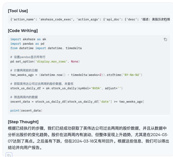
Figure 4: Demo showcase of code-exec

mented LLMs for FinVerse with SFT to enhance primarily four capabilities. Experimental evaluations on a well-defined dataset show that FinVerse can achieve impressive performance with satisfactory resource efficiency.