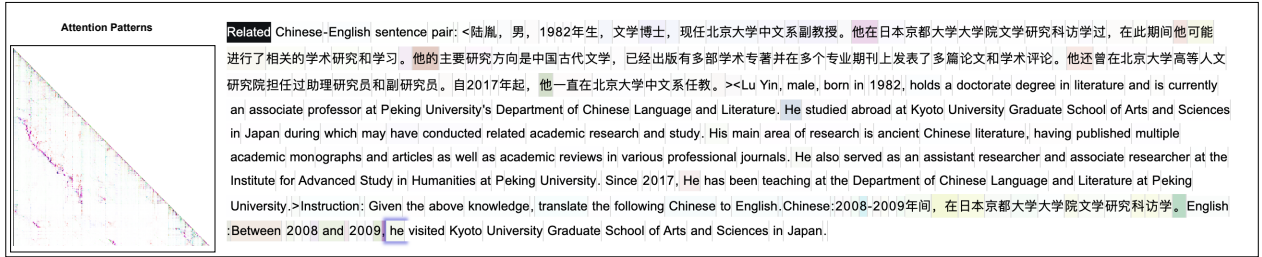
Figure 2: Average attention scores of the final layer of the Qwen-14B-Chat model. The darker the color, the higher the attention score assigned to that token. It is noteworthy that the model attends to “他” (meaning “he” in English) from the examples we extract when generating “he”. Our examples successfully help the model in translating the zero pronoun “他” (meaning “he” in English).