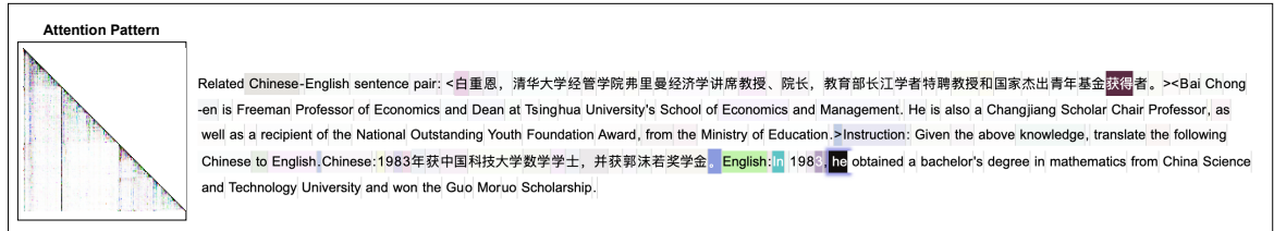
Figure 3: Average attention scores of the final layer of the Qwen-14B-Chat model. The darker the color, the higher the attention score assigned to that token.