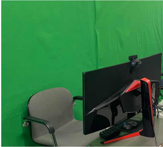
Figure 5: Recording studio setup for MultiDialog dataset

percentage of unique n-grams in the set of responses. Specifically, D-1 measures the percentage of unique unigrams in the generated text, while D-2 measures the percentage of unique bigrams.