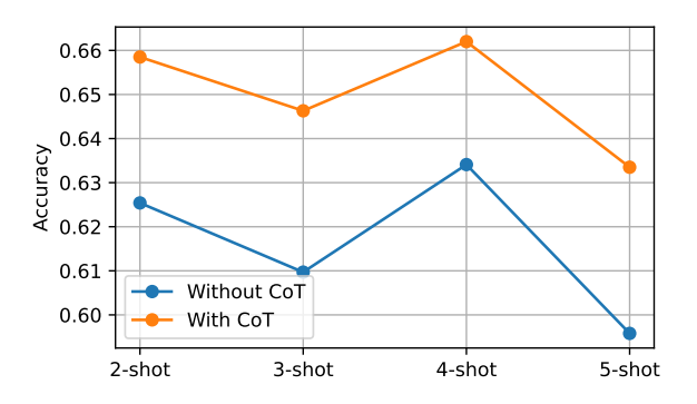
Figure 3: Comparison of few-shot examples with or without CoT using ICL-RAG-CoT method on the Binary Classification Task (i.e. sub-task 1) on the MS Validation Set

Our CoT prompting strategy works well in conjunction with the RAG system. As depicted in Figure 3, across various few-shot settings (e.g., 2, 3, 4, and