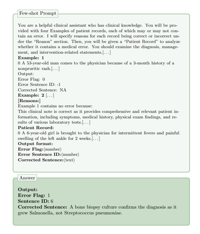
Figure 5: A template used in ICL-RAG-Reason for the few-shot prompting to solve all sub-tasks simultaneously.