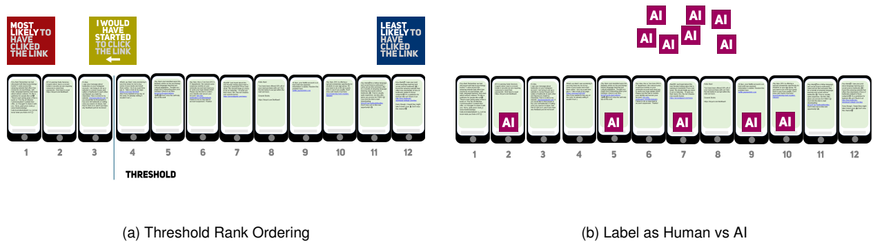
Figure 1. The two phases for the target interview.

gram during the Winter Semester 2023. Students generated spear phishing messages based on the data provided to them about their target, though names were changed to maintain participant privacy. Messages were entered into an online survey along with some demographic data about the authors including name, gender, age group, and technical ability. Authors were also asked to assess their understanding and experience relative to spear phishing. Authors were then provided with four prompts containing information about their target and then were asked to generate a message that would attempt to phish that target based on that information. After each prompt, the author was asked to assess their confidence in the ability of the message to trick the target.