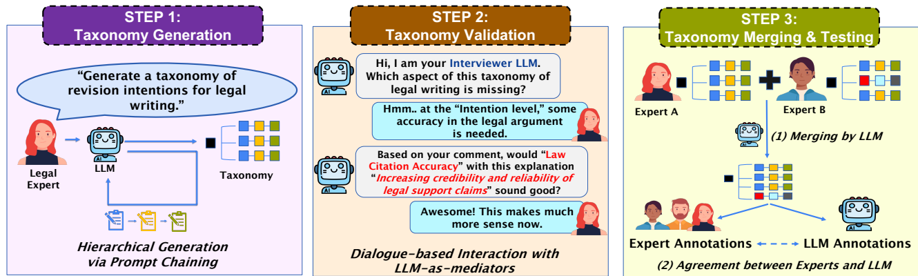
Figure 1: An end-to-end pipeline of our three-step Human-AI collaborative taxonomy construction process. For each step, we portray several design implications for better human-AI interaction strategies that were described in Section 3.