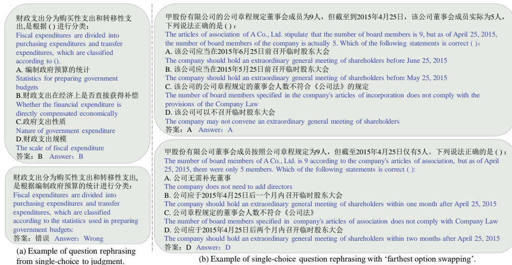
Figure 3: Examples of question rephrasing. English translations are shown in blue for better readability. In each example, the top is the original question, and the bottom is the rephrased question.