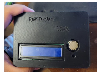
Figure 1: Pain tracker in a 3D printed case.

With this research, we contribute the design, development and evaluation of a portable pain tracking device for chronic pain patients.