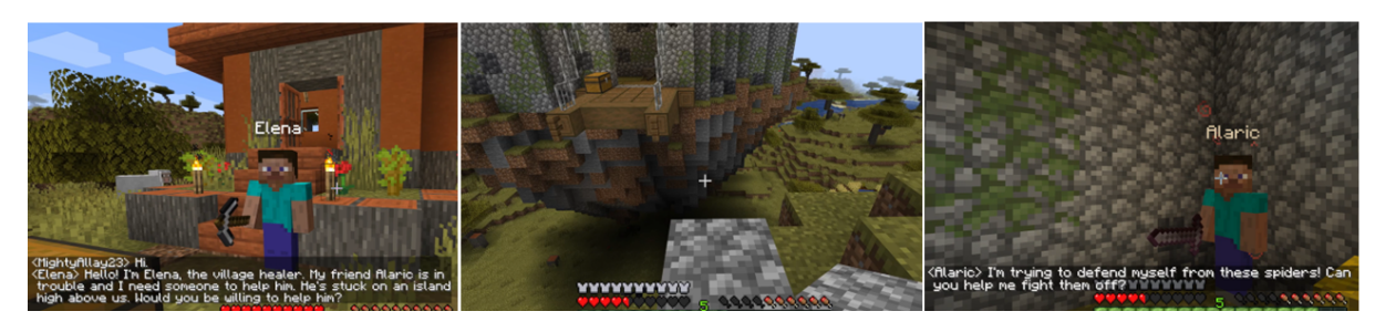
Figure 1: Key steps of the collaborative quest: a) talk to Elena (left image); b) build path to island (center image); c) help Alaric (right image)

resources or attacking mobs. The more interesting and unexpected behavior was that of players helping the NPCs. Specifically, when NPCs did not have the necessary visual or game-state grounding, human players compensated by conveying relevant information to the NPCs. This implies that humans and AI-agents can complement each other's skills/knowledge in a collaborative setup. We also report on various limitations that come from using a language-only model with minimal game-state and almost no visual grounding, and suggest avenues for future improvements.