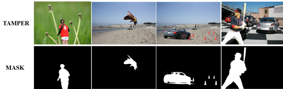
Fig. 1. Tampered images and their corresponding masks for the image manipulation localization task.

Advances in digital image processing have made software like Photoshop and GIMP more powerful, facilitating widespread image manipulation. This proliferation of false information and manipulated images threatens public knowledge, trust, and safety. Thus, image manipulation localization has emerged, and in some literature, it is also referred to as "forgery detection" or "tamper detection." Its purpose is to discern whether an input image is manipulated or authentic and to depict the exact manipulated parts of an image through a mask. These parts are semantically different from the original content (the original image before manipulation). It does not include purely generated images (e.g., images generated from pure text) or the introduction of noise or other non-semantic changes through image processing techniques that do not alter the underlying meaning of the image. Standard tampered images and their masks are shown in Fig. 1.