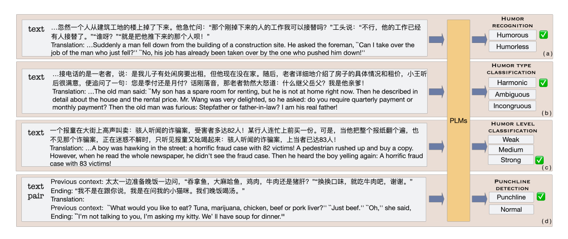
Figure 2: The process for PLMs to perform on four humor-relevant tasks.