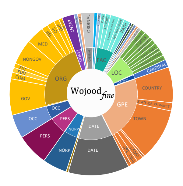
Figure 1: Visualization of the fine-grained entity types in Wojood_{Fine}

NER involves identifying mentions of named entities in unstructured text and categorizing them into predefined classes, such as PERS, ORG, GPE, LOC, EVENT, and DATE. Given the relative scarcity of resources for Arabic NLP, research in Arabic NER has predominantly concentrated on "flat" entities