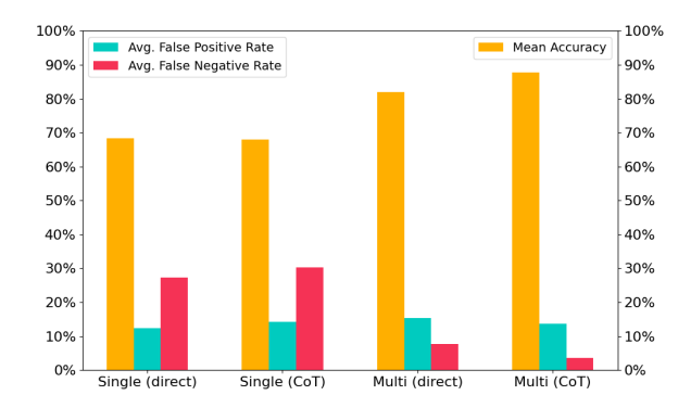
Figure 2: Average mistake identification accuracy, false positive and false negative rates for each MIP variant. For the accuracy, higher score is better. For the false positive/negative rate, lower is better.

et al., 2021a). In addition, while the multi-instance setup benefits from the CoT prompting, the singlemodel one is negatively affected with gains in false negative error rate. The CoT explanations showing inconsistency in assessing requested error types due to misunderstanding of the definition supports these observations.