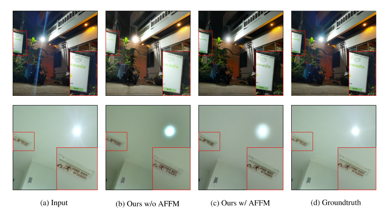
Figure 4: Visual comparison on the effect of AFFM. Without AFFM, SGIM can effectively remove lens flare, but there are significant distortions on flare-free areas. When AFFM is employed, the fidelity of flare-free areas has been maintained between the input image and the restored image.

yield overly sharp results, whereas Difflare generates more harmonious results with the background, attributable to PTDM utilization. For rows 1, 2 and 5, it can be seen that the method proposed by Zhou et al. [1] tends to produce over sharp results, while Difflare tends to produce results which are more harmonious with the background, thanks to the use of PTDM. Rows 2 and 4 demonstrate that Difflare better preserves light sources than other methods and effectively eliminates undesirable artifacts caused by lens flare. Row 3 indicates that Difflare produces results more closely resembling the ground truth images.