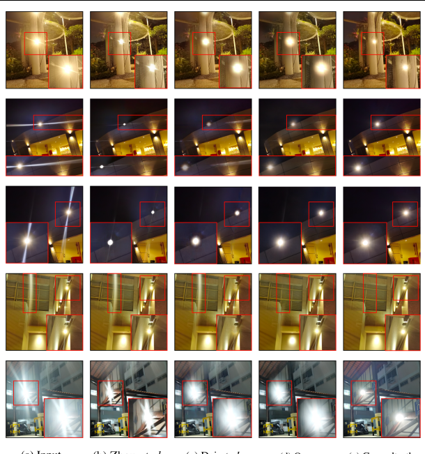
(a) Input (b) Zhou et al. (c) Dai et al. (d) Ours (e) Groundtruth Figure 3: Visual Comparison on Flare7K [ G ] testset. Our proposed method can effectively remove lens flare and unwilling artifacts, while harmonizing the recovered light source and the background.

leading to a noticable decrease in structural similarity and perceptual quality. Wu et al. 's method [26] and Zhou et al. 's method preserve the light source by adding back the center of the flare with a given threshold, leading to over-sharpen results, thus result in a relatively low perceptual quality. Dai et al. 's method [2] achieves the best PSNR, thanks to its data synthesize pipeline and network structure. However, it occasionally removes the light source or produces over-sharpen results, leading to decrease in MUSIQ and CLIPIQA. Our proposed method outperforms the existing benchmark methods in structural similarity preservation, due to the proposed AFFM, and can generate results with best perceptual quality, thanks to the prior captured by PTDM.