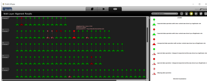
Fig. 2. Screenshot of the MLA Tool- Projection to Data log visualisation

Fig.2 shows another visualization which is available in the MLA tool as “Projection to Data Log”. This visualization was implemented to indicate the violations related to the data layer specifically. MLA is able to detect four kinds of important data layer deviations such as executed data operation by an illegitimate role, unexpected, ignored and missing data operations. Furthermore, this visualisation provides the answer to the important privacy rule, “who performed which data operation for which purpose?” by indicating the context of each data operation executed during a business process. By leveraging the reconciled view of the three data, process and privacy perspectives, it can detect and mark which data operations were executed with unclear or secondary purposes. Moreover, MLA can detect violations of data privacy where data was accessed by an authorised user in the system but with an illegitimate role in the process. As an example, in the treatment process several roles like doctors, nurses, and lab experts are allowed to access sensitive data of the patients, such as medical history and test results. A curious actor may exploit his/her privilege in order to use the information of patients for personal or financial gain. MLA can detect such scenarios that violate individual’s data privacy.