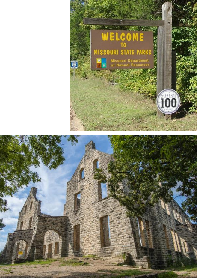
Ha Ha Tonka State Park