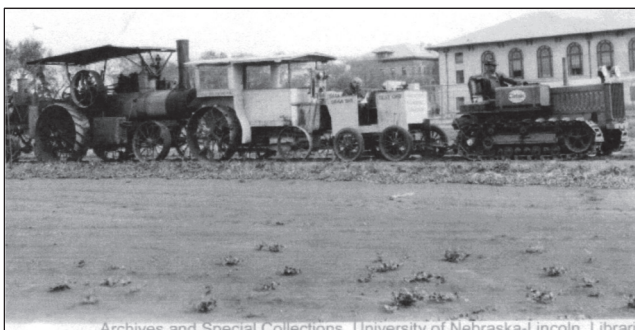
Figure 5. The second test car using a load tractor that is in turn pulling a steam tractor.

Various changes in tractor testing technology also occurred in the 1920s. As noted above, the dynamometers used for measuring belt horsepower in the 1920s are not precisely known. There are references to 40 HP, 120 HP and 150 HP dynamometers. Further, a period photograph exists (figure 4) of a tractor undergoing belt testing using a Prony Brake dynamometer outside the test lab. It is clear that by 1930, a 150 HP electric resistance dynamometer was in use. Other changes involved the drawbar tractor test. It was found that use of the cinder and clay test track caused the cinders and clay to separate with simply clay on the top surface, so the track was remade using only clay. Equipment was acquired to allow the track to be restored after use so that the consistency of the pulling surface could be maintained from test to test and year to year. This practice continued until 1956 when a concrete track was installed. In addition, several test cars and load units were developed for drawbar testing. Figure 5 shows what is believed to be the second test car. A steam tractor is acting as a load unit, most probably acting as a compressor for additional drawbar loading (Splinter,