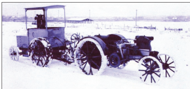
Figure 3. First load car.

It was soon realized that the original tractor test law did not address funding for the NTTL. A change to the law was made, effective for the 1921 testing seasons, that allowed the NTTL to collect fees from entities submitting tractors for test to cover the cost of operating and maintaining the NTTL. Power to set fees was delegated to the University by the Legislature and initial fees were set at $250 per tractor model tested.