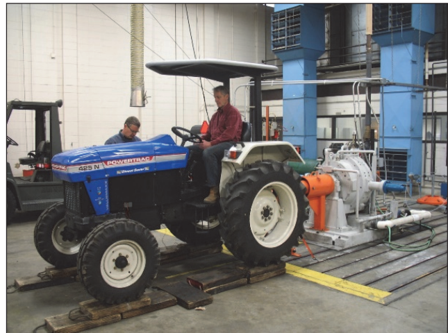
Figure 11. Solectrac utility tractor on test at the NTTL.

An additional challenge is to better relate the current tractor test to implement power requirements. Field implements