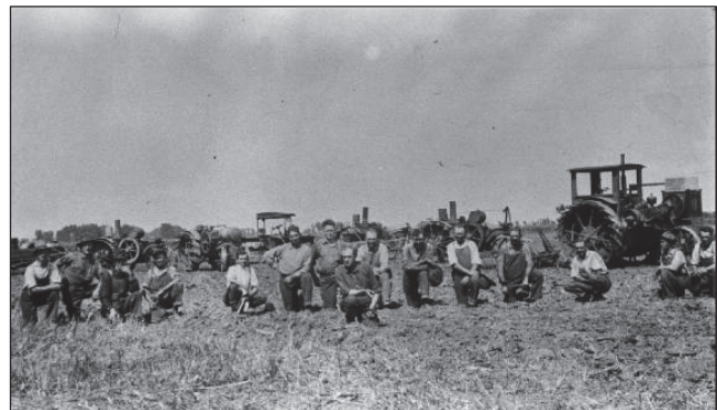
Figure 1. The Winnipeg plowing contest.