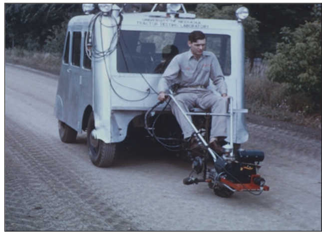
Figure 8. Test 449—the Choremaster, 0.7 drawbar HP.