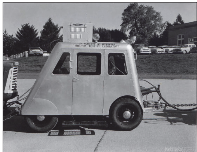
Figure 6. The Adams test car.

Changes in tractor technology drive changes in tractor testing procedures and equipment, and there were many in the 1930s. A major change in tractor technology occurred in 1934 when the first rubber tired tractor, the Allis Chalmers WC, was introduced. For the next several years, it was common for the NTTL to test the same model of tractor on both steel wheels and rubber tires, but in 1937 the last test of a tractor equipped with steel wheels was conducted. A new load car (figure 6) was designed in 1937 by Charlie Adams, implemented in 1938, and (although heavily modified over time) used until 2003. This, the third load car, was equipped with precision pressure gages that monitored the pressure in the hydraulic cylinders used for measuring drawbar loading.