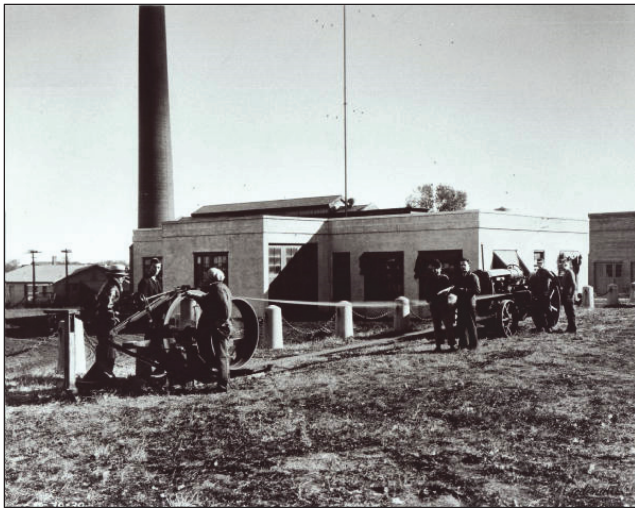
Figure 4. Early belt testing.