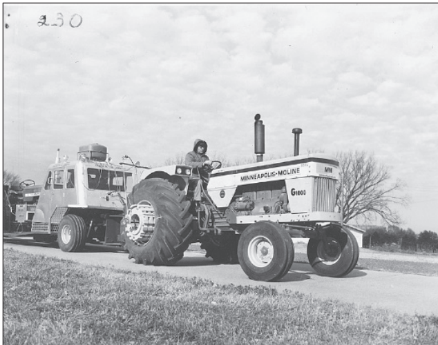
Figure 9. Test 953, Minneapolis Moline G1000 diesel using the revised load car.

The NTTL has always solicited opinions from producers and tractor manufacturers to improve the tractor tests. In the late 1960s producers suggested sound measurement be added to help producers select quieter tractors. This test was instituted in 1971 with Test 1063. It determined noise at the operator ear to be 97.0 dB(A). Interestingly, as soon as sound numbers began to be published in NTTL tractor test reports, manufacturers began to compete with each other to produce quieter tractors. While such changes would likely have taken place at some point, perhaps the introduction of the sound test at the NTTL acted as a catalyst to cause sound reduction to occur sooner than it otherwise might have. The development of the first sound measurement system and testing procedure was conducted by Ned Meier, as a part of his master's research project (Meier, 1970). Meier, who joined Caterpillar following his time at the NTTL and UNL was sent in the early 1970s to an agricultural farm show by Caterpillar to gain understanding of new features of agricultural tractors. Meier's report indicated that agricultural tractors were much quieter than construction machines. This caused Caterpillar to also produce quieter machines leading the rest of the construction industry to follow suit.