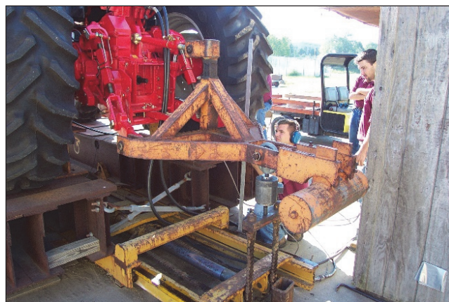
Figure 10. Hitch lift test 610 mm behind hitch balls.

Hydraulic Power Tests. During these tests, OECD Code 2 requires the hydraulic oil temperature to be maintained at 65^{\circ} \pm 5^{\circ}\text{C} . A test fixture is connected to the tractor's auxiliary service couplings that consists of pressure transducers located at each coupler pair, a flowmeter, and a restrictor valve that can be manually adjusted to restrict flow and increase pressure. During testing, the engine is maintained at full throttle and engine speed is recorded continuously during