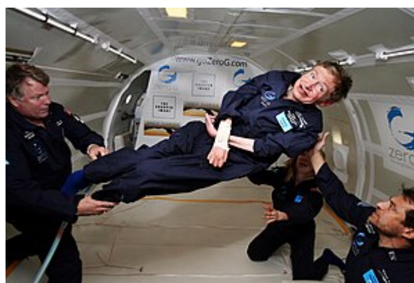
Hawking defies gravity in a modified Boeing 727