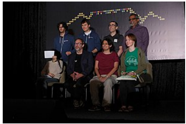
WMF Board of Trustees in 2018

The Wikimedia Movement is unique for its reliance on community participation even at the level of governance of the Wikimedia Foundation as steward of the Wikimedia projects and administrative support of the Wikimedia Movement. All trustees have an equal term and stand for regular reelection. For beginners to understand the Wikimedia Foundation Board of Trustees , think "1, 2, 3, 4" to remember the allocation of seats on the Board of Trustees. There is 1 Founder's seat for Jimbo Wales whom the board itself has the option to confirm each term.