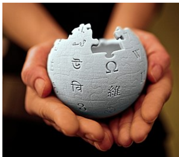
Start and join conversation about the election by inviting all interested stakeholders to discuss on or