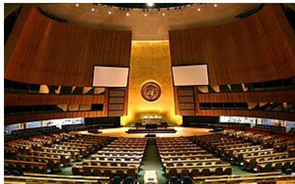
The United Nations General Assembly is one of the models for this election and process.

The Wikimedia community is vast and the majority of stakeholders in this election underappreciate the opportunity that this election process offers. Anyone can start a conversation on wiki, and anyone can write and direct messaging and invitations to participate to individual organizations which might vote. Localization of discussion about the election is important for diversity and inclusion in the voting process. Global participation makes for a robust election. Anyone who identifies challenges and shortcomings should publish what they see for the betterment of this and all subsequent elections.