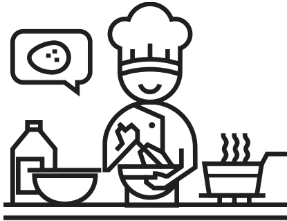
Guided learning (Structured)

What's your learning mode when cooking a new dish? Circle the one that's closest to your approach.