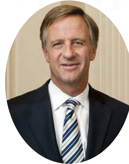
Bill Haslam GOVERNOR