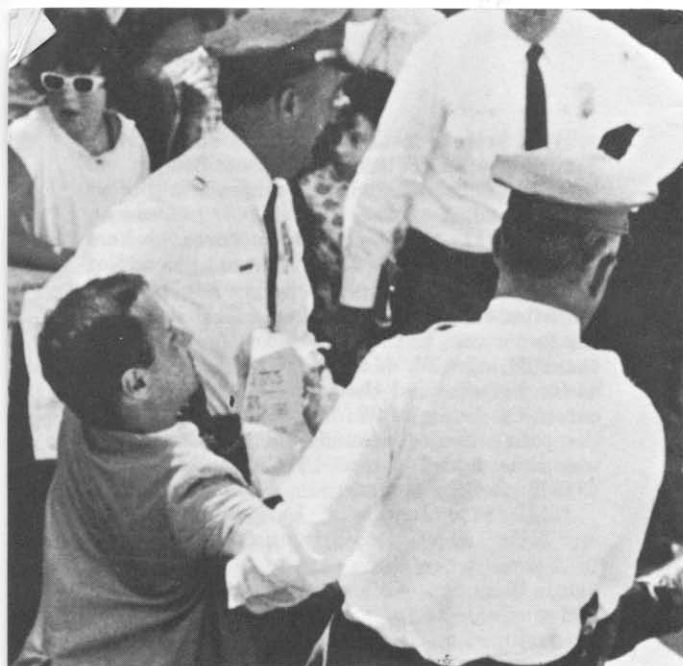
CORE demonstrator is given police escort.