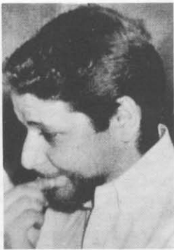
CORE workers James Chaney and Michael Schwerner who were abducted and murdered this summer outside of Philadelphia, Miss.