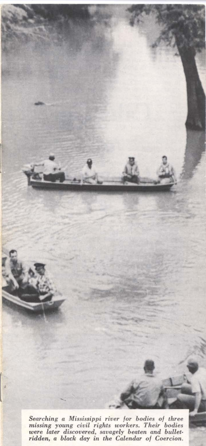
Searching a Mississippi river for bodies of three missing young civil rights workers. Their bodies were later discovered, savagely beaten and bullet-ridden, a black day in the Calendar of Coercion.