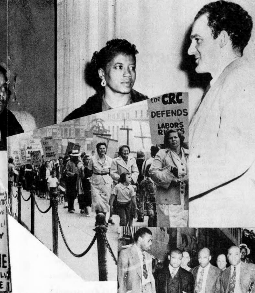
(ABOVE) Los Angeles mothers and children march in CRC picket-line to halt Smith Act persecutions and arrests. (RIGHT) Four of the Trenton Six outside death house. After CRC took up their fight, four were freed in a re-trial.