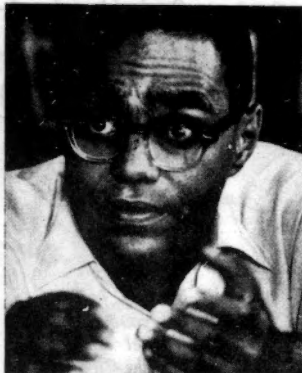
Robert Moses, a teacher, went south when the sit-ins began.