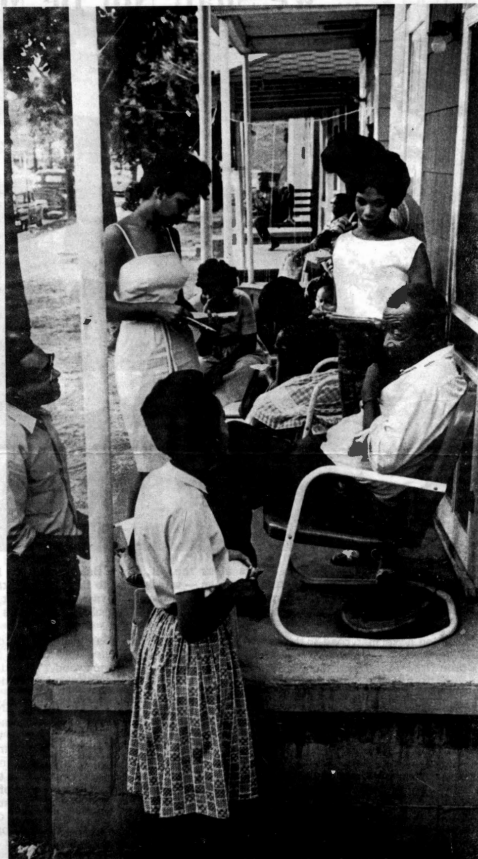
Pushing ahead with the voter-registration drive, Robert Moses and girl field workers whom he has trained urge a potential voter in Jackson, Miss., to make an attempt at registering.

"It's a race against time," one man put it. "At one end you've got groups like the Muslims saying, 'To hell with the white man.' At the other end you have the student movement saying, 'Stand up for your rights with non-violence.' I think the students are gaining. If they aren't, then God help us all." THE END