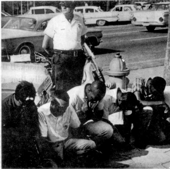
9/8/62 [Signature] Demonstrating for civil rights, youthful Negroes kneel and pray before the City Hall in Albany, Ga. They were arrested by police when they refused to disperse.

The Saturday Evening POST FOUNDED IN 1798 BY Benjamin Franklin