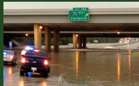
Flooding on Briley Parkway in Nashville, TN.