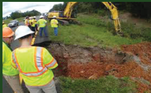
A sinkhole on Interstate 24 in Clarksville, TN, following heavy precipitation.