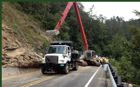
Rockslide along a road in Polk County, TN, following heavy precipitation.