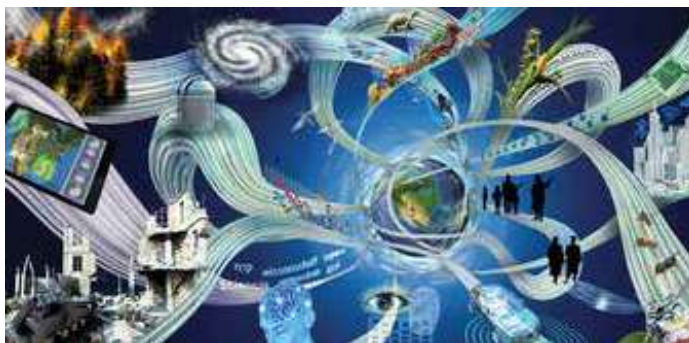
Office of Budget, Finance, and Award Management (BFA)