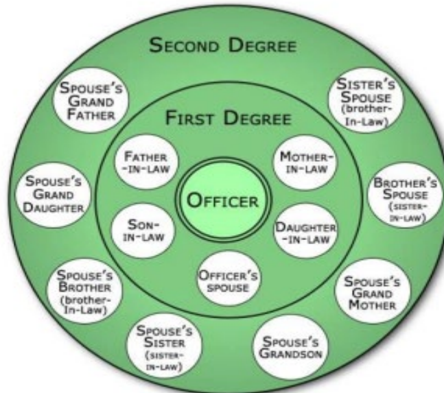
AFFINITY KINSHIP Relationship by Marriage