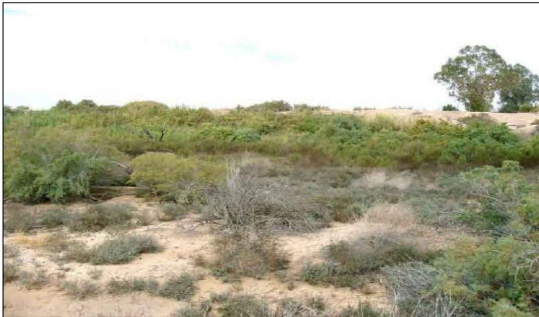
4. View of the western portion of the Alamo River Site from the southern side.