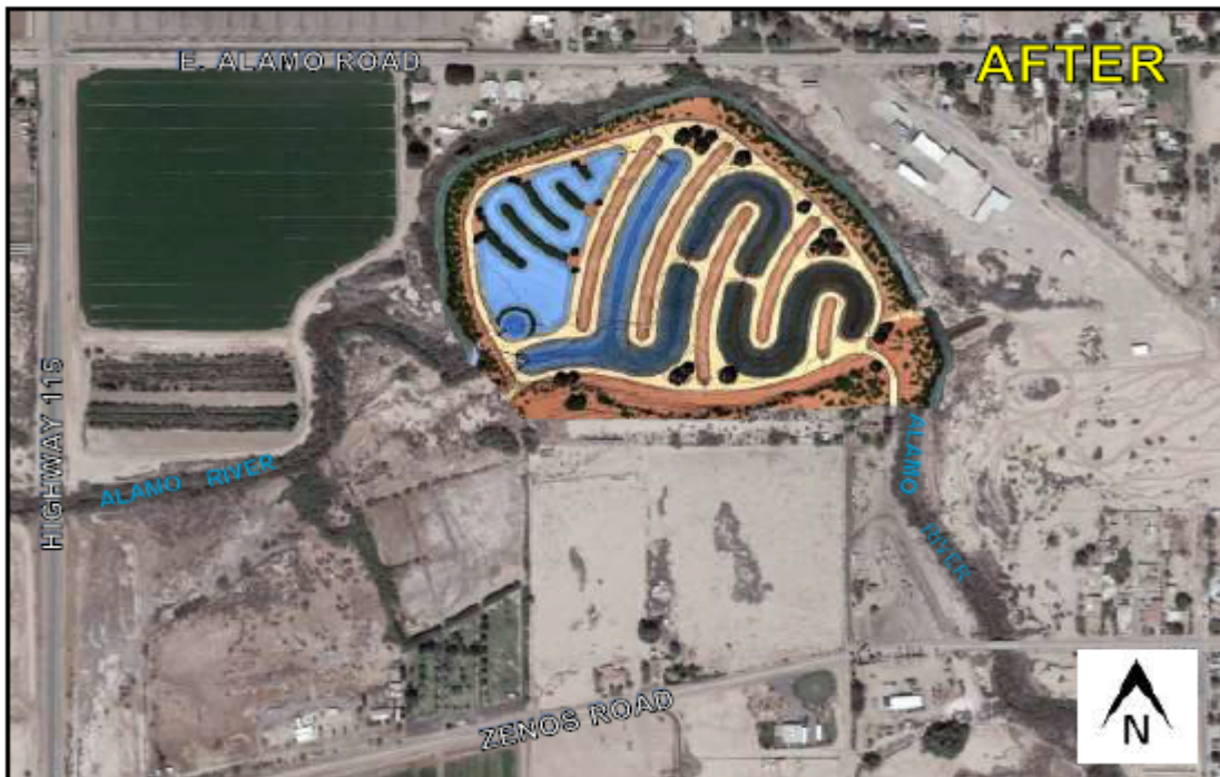
Figure 3: Aerial Photos