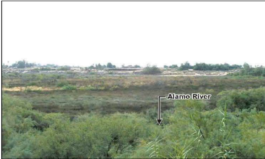
1. View of Alamo River Site from north side of Alamo River facing south.