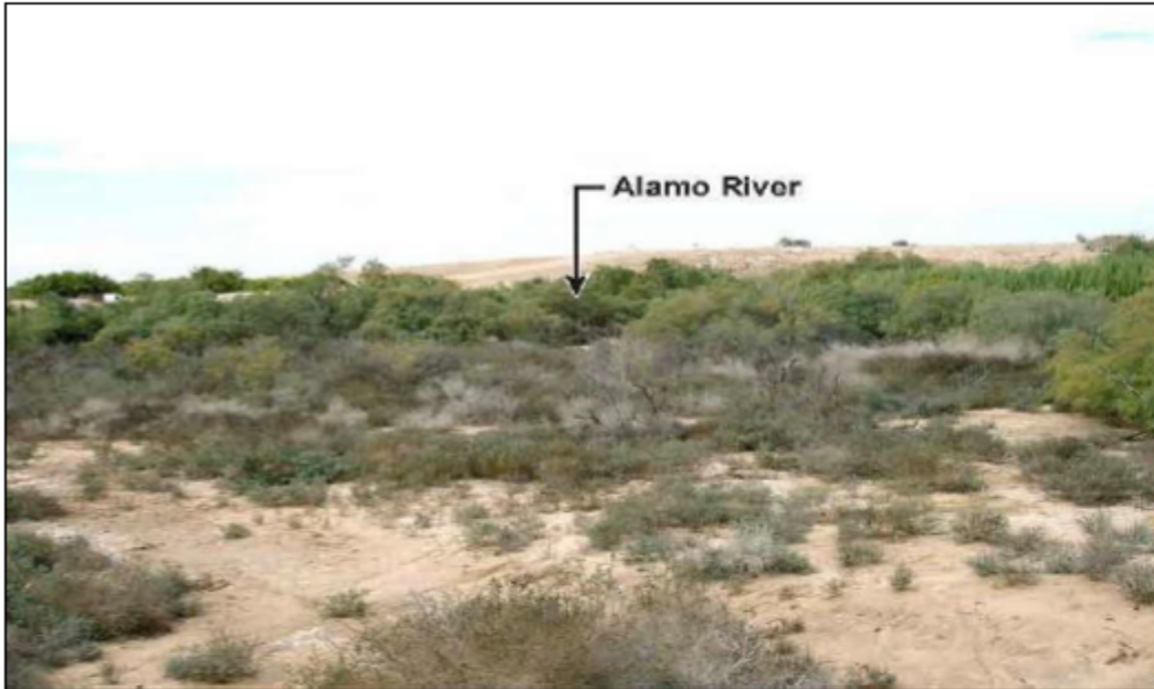
3. View of the western portion of Alamo River from the southern side of the Alamo River.