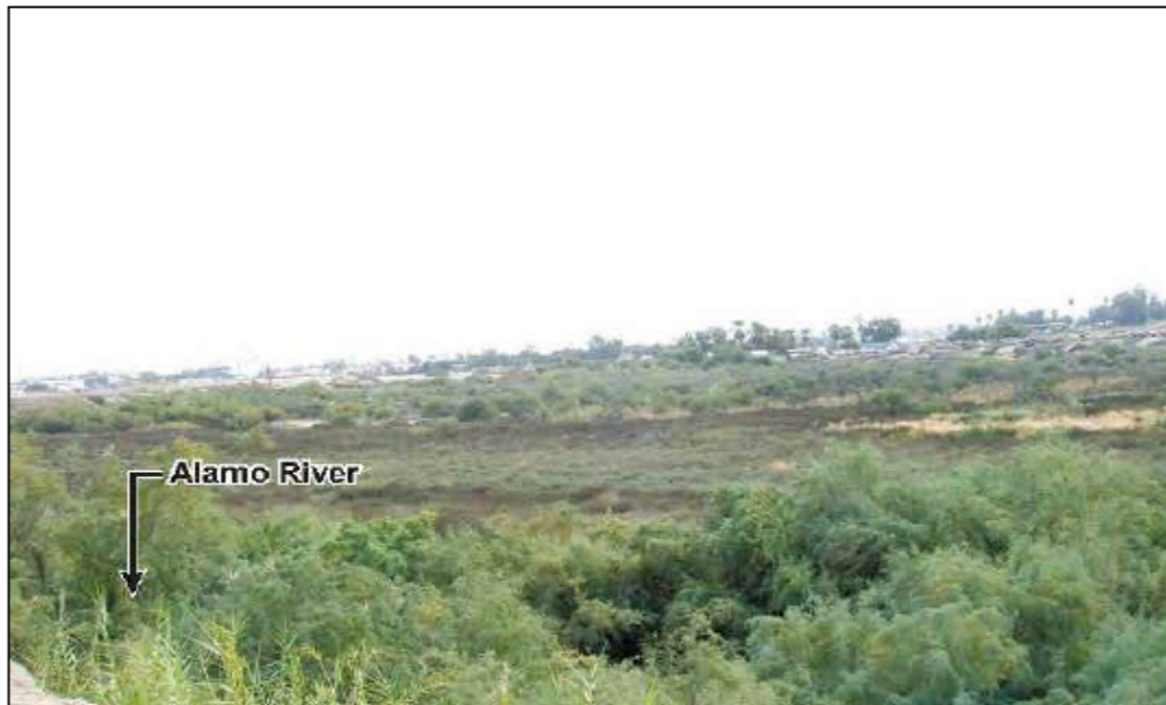
2. View of the eastern portion of the Alamo River Site from north bank of the Alamo River.