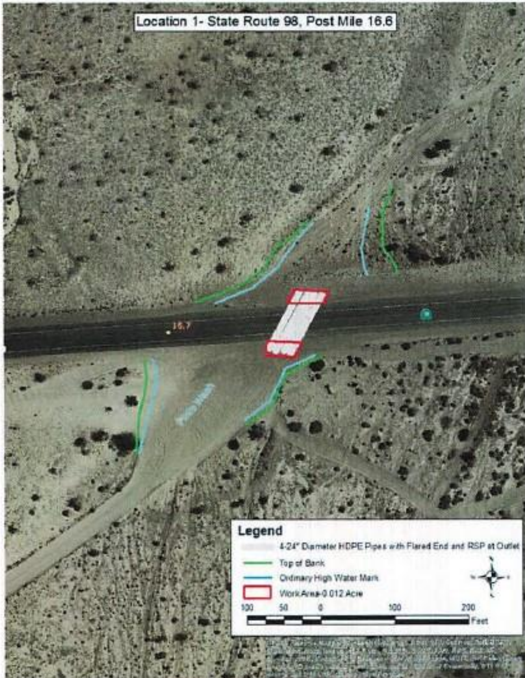
Figure 4: Impact site 2 (PM 16.6).