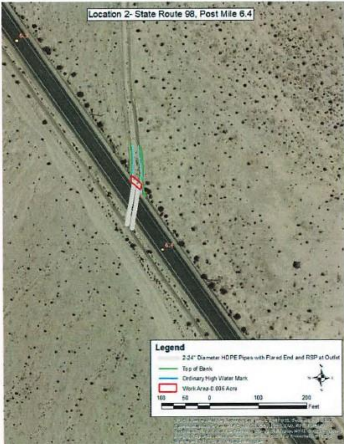
Figure 3: Impact site 1 (PM 6.4).