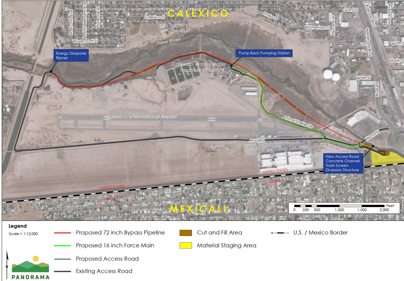
Figure 2 Project Location