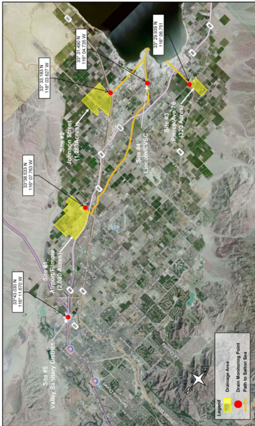
Aerial photograph showing the sampling locations that are representative of discharges from Irrigated Agricultural Lands in Coachella Valley.