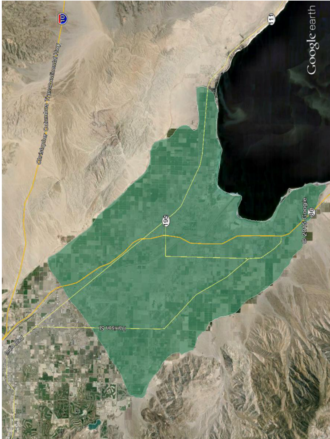
CALIFORNIA REGIONAL WATER QUALITY CONTROL BOARD COLORADO RIVER BASIN